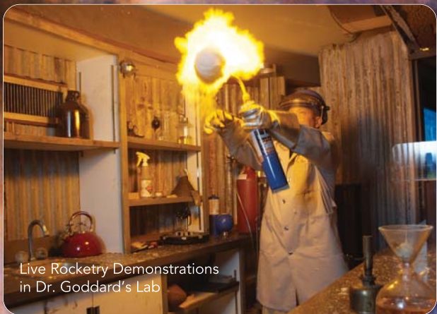
Live Rocketry Demonstrations in Dr. Goddard's Lab

• Hot rockets. Cool cockpits. Alien adventures.